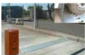
• Tyre Killers

FAAC India introduced hydraulics in the gate opening sector. And have perfected this technology adapting it to a multiplicity of needs. FAAC automated systems satisfy both Intensive use and Economic use. FAAC India began making its own electronic equipment which include control equipment, radio controls, as well as safety and signaling systems.