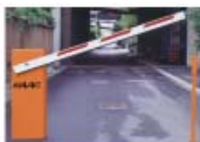
• Boom Barriers